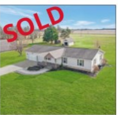
123 Shawnee Drive