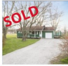
363 Waynoka Drive