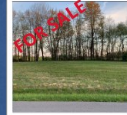
Lot 1514 Sitting Bull