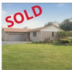
840 Waynoka Drive