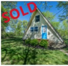
140 Tupelo Drive