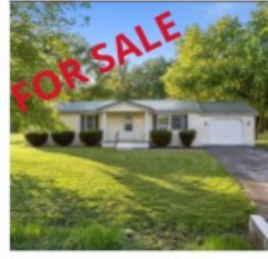
2020 Piute Drive