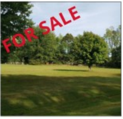
Lots 316-317 Comanche Drive