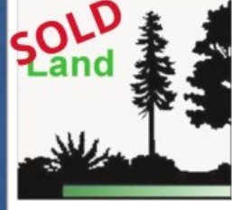
Lot 1968 Bonanza Drive