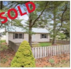
193 Sitting Bull Drive