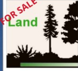
Lot 3980 Waynoka Drive