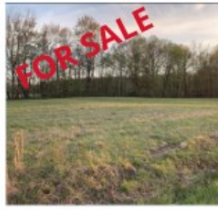
Lot 1513 Sitting Bull