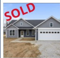
70 Comanche Drive