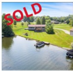
10 Apache Cove