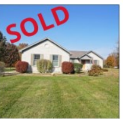
1160 Waynoka Drive