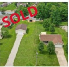
414 Waynoka Drive