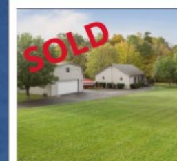
830 Waynoka Drive