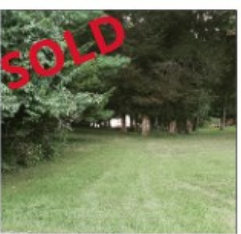
337 Waynoka Drive