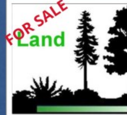
Lot 3988 Waynoka Drive