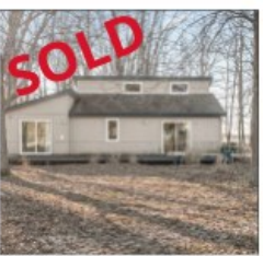
265 Waynoka Drive