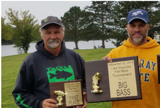
1st Place - Lovin & Lovin