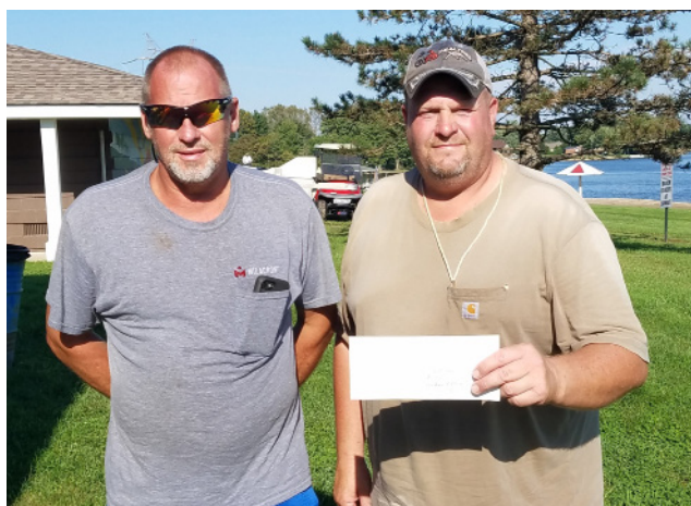
2nd Place - Denham & Iles